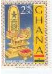
Fig. 5 - State Chair