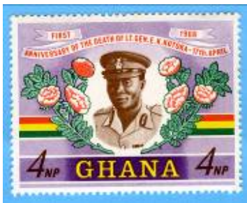
Fig. 13 – Lt. Gen. E. K. Kotoka