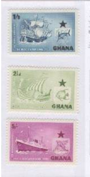
Fig. 9 - Black Star Line