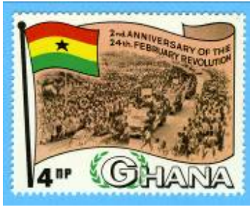
Fig. 12 – NLC Victory Parade