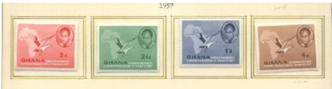
Fig. 4 - Ghana Independence Stamps