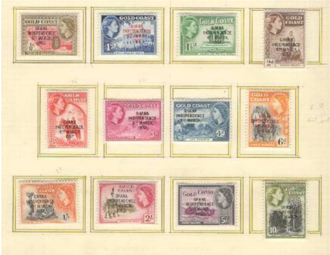
Fig. 2 - Last British stamps at independence with overprint "Ghana Independence 1957".