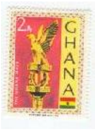
Fig. 6 - Ghana Mace