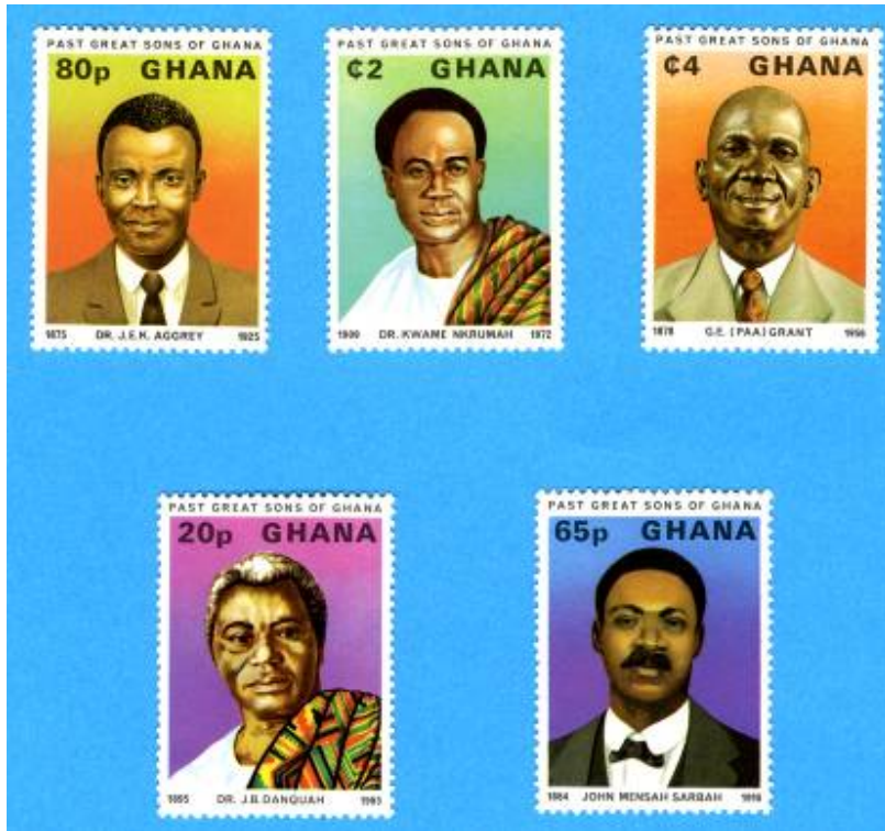
Fig. 17 – Past Great Sons of Ghana