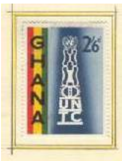
Fig. 7 - UN Trusteeship