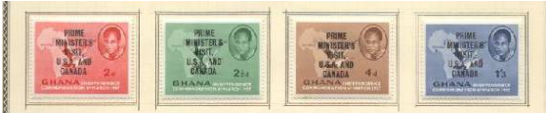
Fig. 10 - Overprint – Prime Minister's Visit