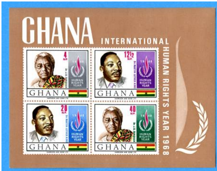
Fig. 14 – Dr. J. B. Danquah and Dr. Martin Luther King, Jr.