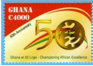
Fig. 19 – 50 th Anniversary Logo.