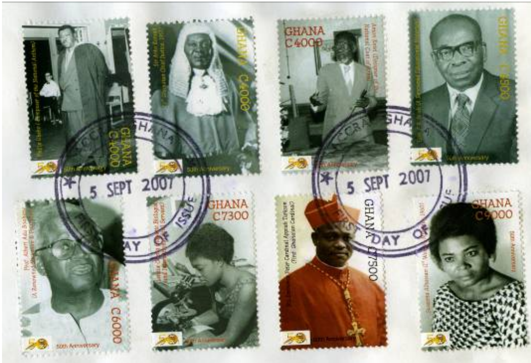
Fig. 20 – Famous Personalities.