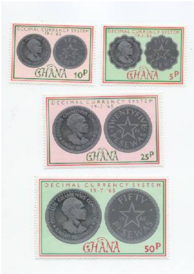
Fig. 3 - Dr. Kwame Nkrumah's image on coin stamps