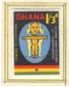
Fig. 8 - Fertility Stamp - Akwababere