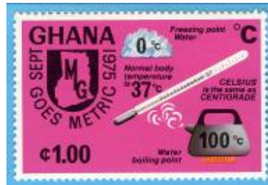
Fig. 16 – Ghana Goes Metric