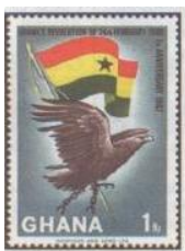
Fig. 11 – NLC First Anniversary